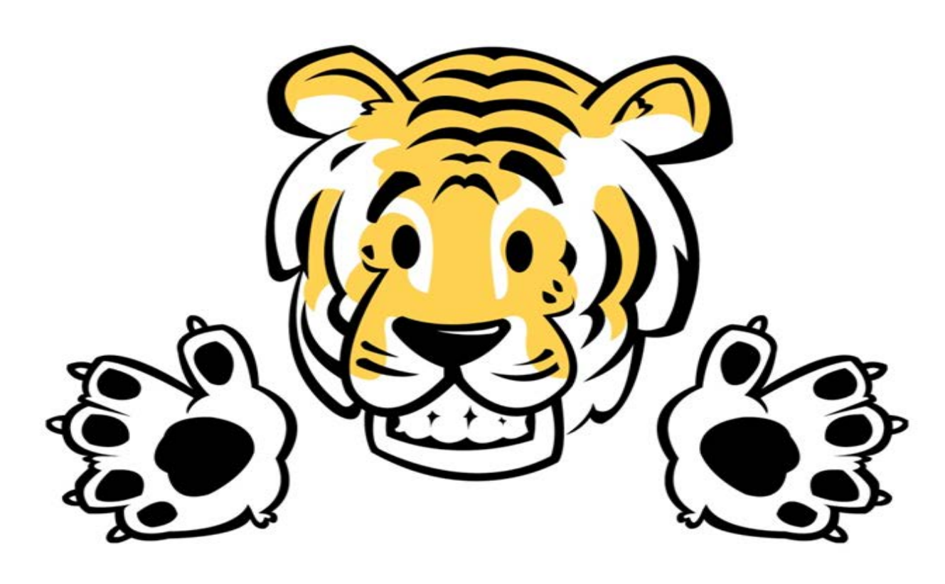
Be Your Best!